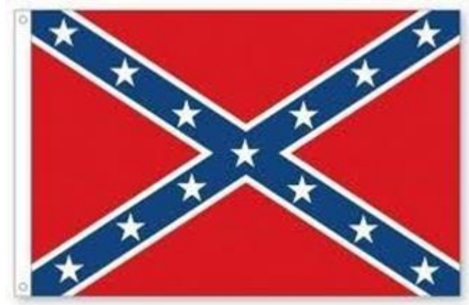
Confederate flag picture